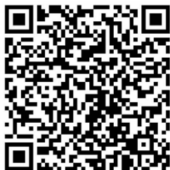
Church Picnic Volunteers docs.google.com

CE will be hosting the Annual All Church Picnic on Sunday, June 8th, and we need your help! We are looking for some volunteers to help us before, during, and after the picnic. Please scan the code below for the volunteer sign-up sheet.