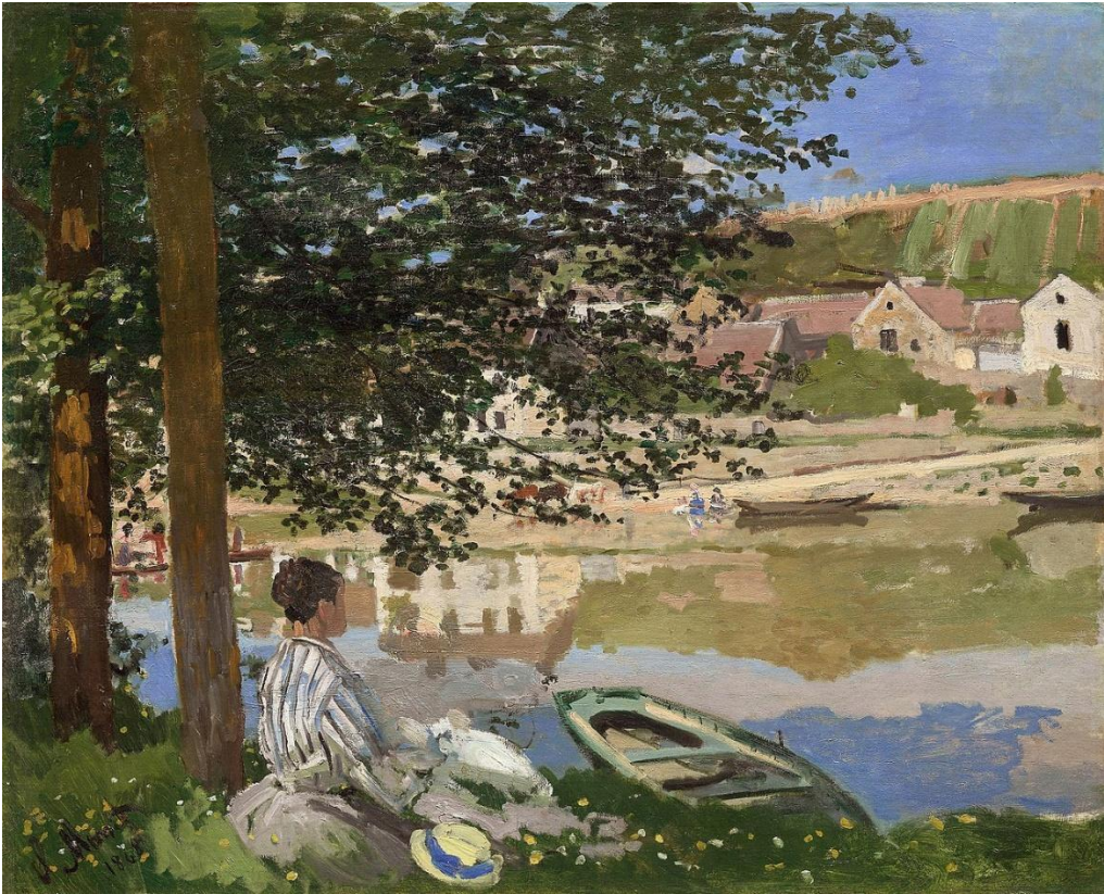
On the Bank of the Seine, Bennecourt by Claude Monet

But I trusted in your steadfast love; my heart shall rejoice in your salvation. I will sing to the Lord because he has dealt bountifully with me. Psalm 13:5-6