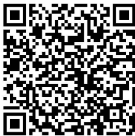
2025 All Church Picnic docs.google.com

If you plan to join us please scan the QR code to register so we know how many burgers and hot dogs to buy. We will also have a sign-up table in Fellowship Hall during Coffee Hour the next few weekends. The cost is $2 per person and $8 per family. We look forward to spending this time with all of you!