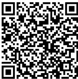
2025 All Church Picnic docs.google.com

If you plan to join us please scan the QR code to register so we know how many burgers and hot dogs to buy. We will also have a sign-up table in Fellowship Hall during Coffee Hour the next few weekends. The cost is $2 per person and $8 per family. We look forward to spending this time with all of you!