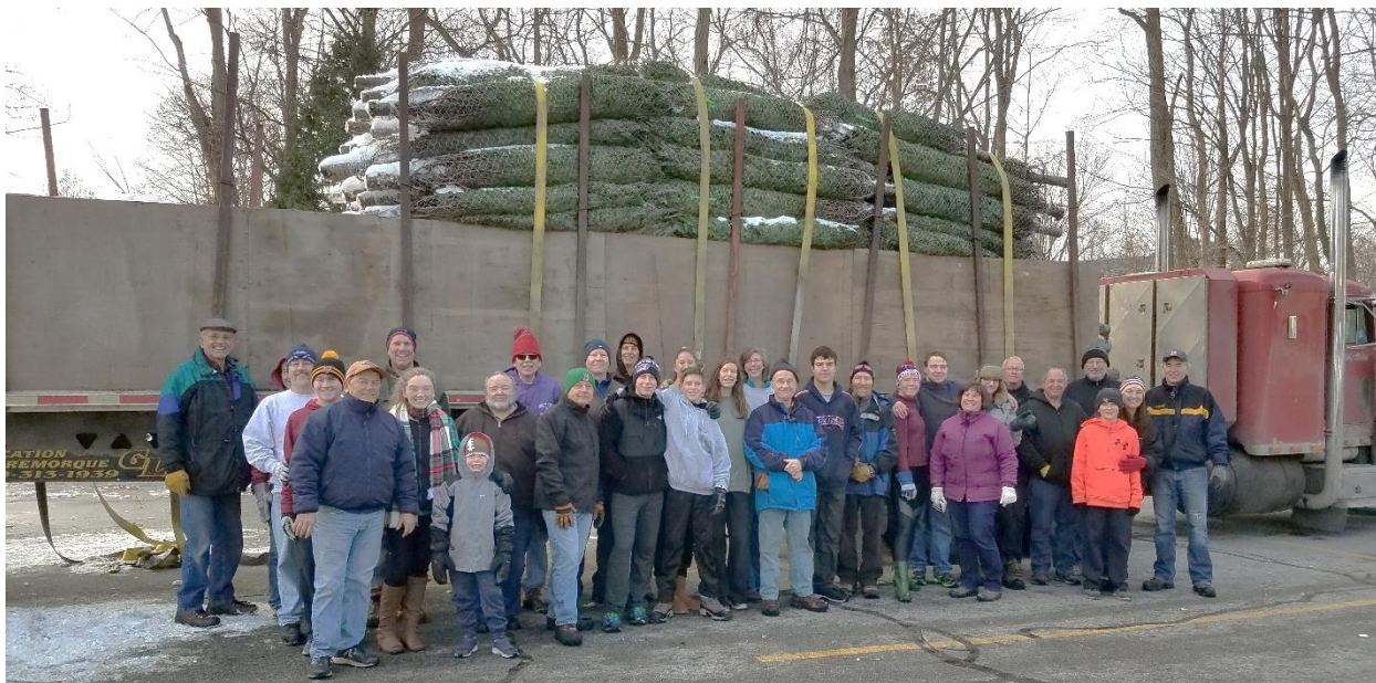
Christmas Tree Unloading Team – Early Sunday, November 18 th ! Thank you!!