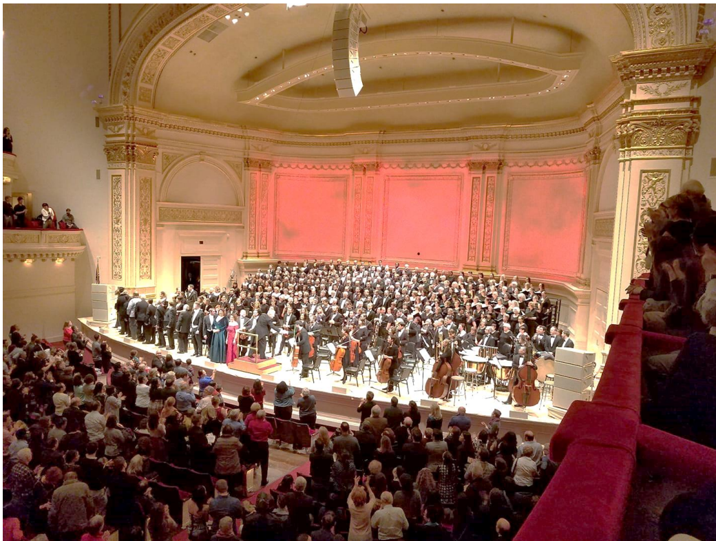
Our choir was part of this performance on December 3 rd at Carnegie Hall!