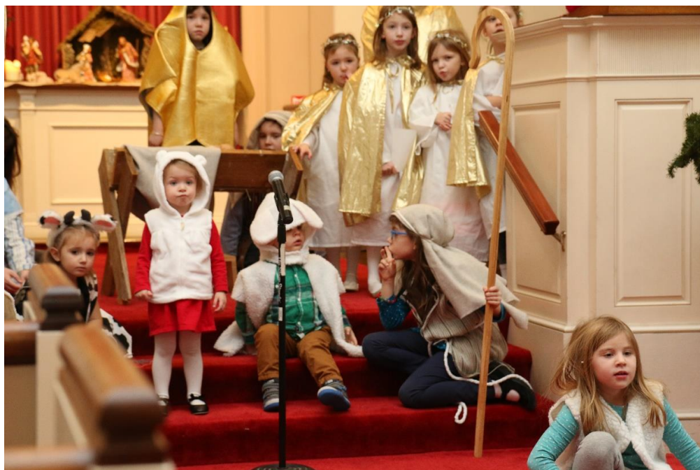
Angels and Lambs at the Christmas Pageant – Sunday, December 16 th