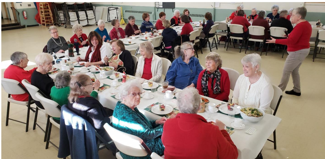
KiSeLo Christmas Luncheon