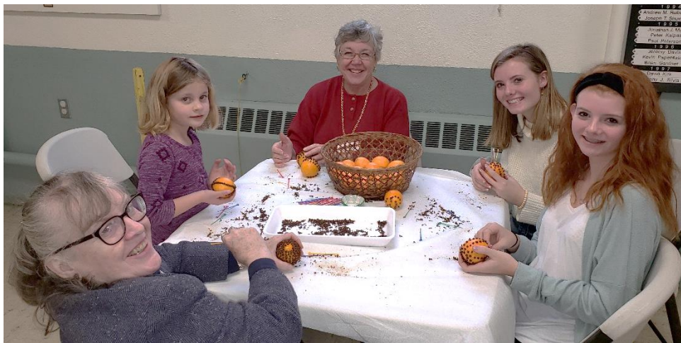
Advent Festival – Sunday, December 2 nd