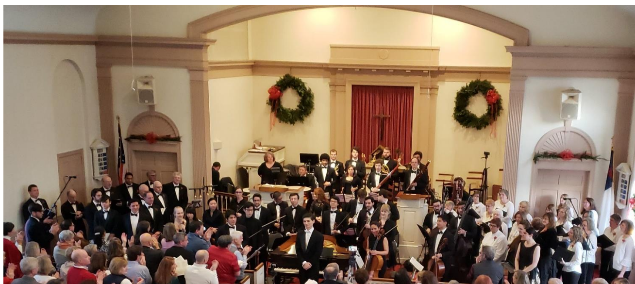
"Ode to Joy" Concert at Central Congregational Church on Sunday, December 9 th

Go to YouTube to see a recording of our Christmas Concert: 2018 Christmas Concert