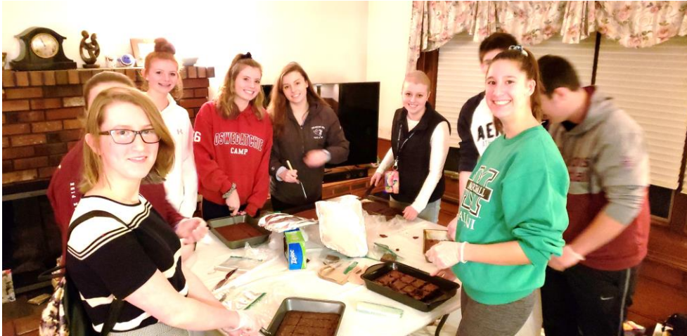
Sandwich making the night before